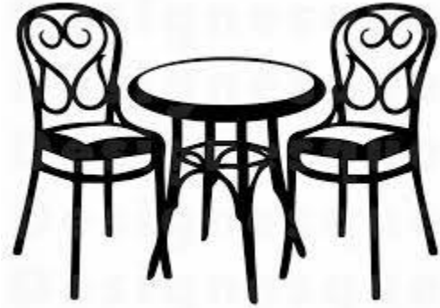
Table and Chair Rental

Tables and chairs are available for rent through TWP Food Service.